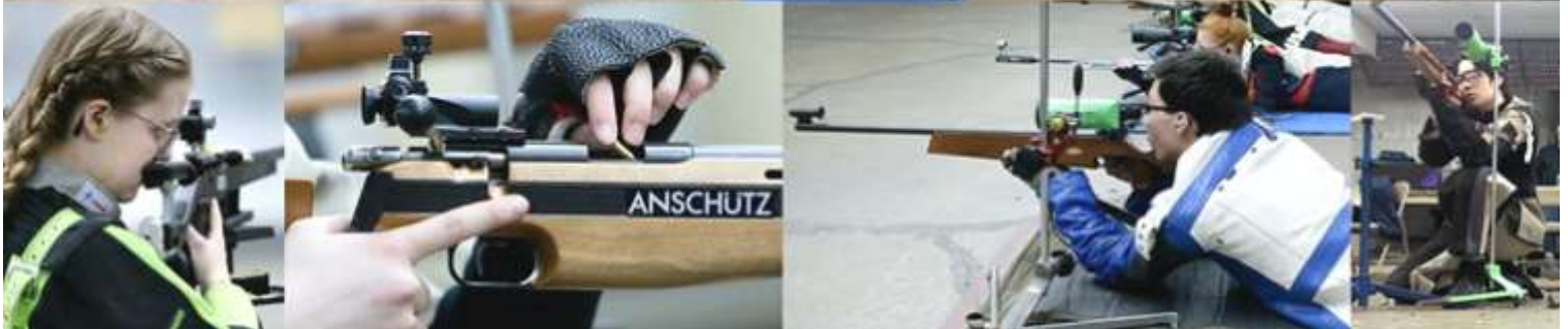
DSC hosts the 2020 NRA Junior Rifle Sectionals Feb. 22 & 23 (smallbore and air rifle)